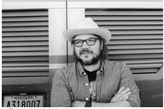
Jeff Tweedy

Package Value: Priceless / Starting Bid: $1000. / Minimum Incremental Bid: $500.