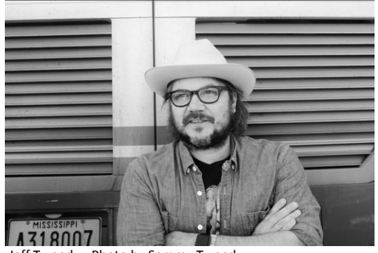
Jeff Tweedy

Package Value: Priceless / Starting Bid: $1000. / Minimum Incremental Bid: $500.